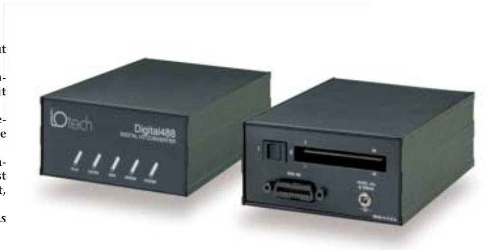
Digital488 provides an economical link between an IEEE 488 controller and digital signals

The Digital488™ adds TTL-level digital input and output capability to IEEE 488 based systems. The unit provides complete digital I/O handshaking, including data latch input, service request input, new-data output, clear output, and a trigger output.